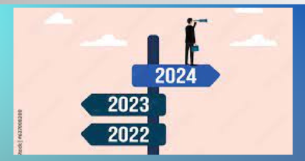
Looking forward to strengthening our relationships in 2024!

-Agencies submit Permanently Assigned Vehicle Requests - Annual Report -Agencies with Agency Specific Motor Pools (Independent Fleets) submit mandatory Annual Reports (Also add plan to increase Alternative Fuel Vehicles (at least 50% of fleet))