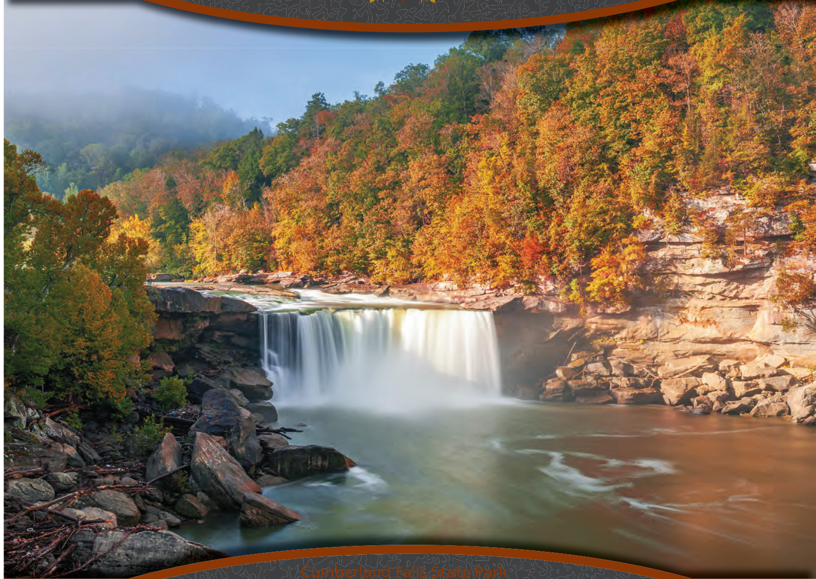
Cumberland Falls State Park