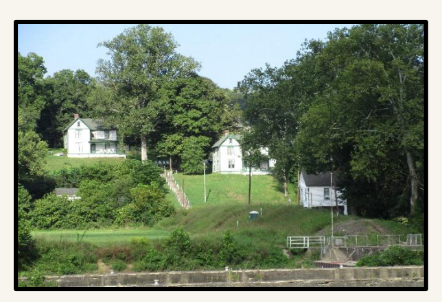
Lock No. 10 reservation circa 2016.

On the Kentucky River, the lockmaster, the lockman, and their families lived on government-owned land containing the lock and dam known as a reservation. Typically, the site included two residences (referred to as lockhouses), domestic outbuildings, outbuildings for storing equipment, and stables and barns for keeping livestock.