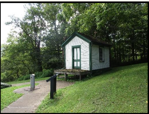
Lower lockhouse laundry building and coal house (left) and upper lockhouse laundry building and well pump (right) circa 2016.