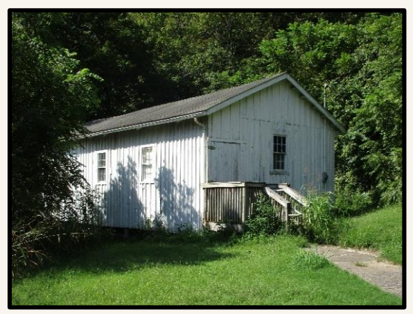
Lock office (top) and barn (bottom) at Lock No. 10 circa 2016.

At Lock No. 10, a small office was constructed along the berm that extends from the dam to the lockhouses. This was the second office built on the reservation; the first office was swept away by the floodwaters in March 1905. Here, the lockmaster and lockman oversaw the daily operation of the lock and made entries in the logbook. Next to the office is a bell for boats wishing to pass through the lock. Ringing the bell notified the lockmaster that a boat was waiting at the lock.