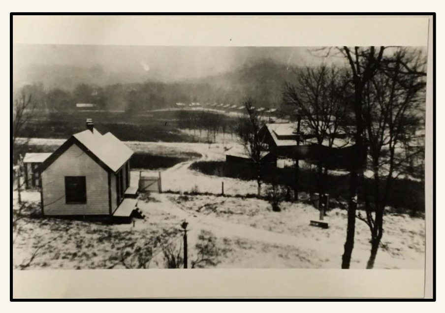
Lower lockhouse laundry and coal house during the early or mid-twentieth century. The Boonesboro Beach resort, established in 1909, is visible in the background.