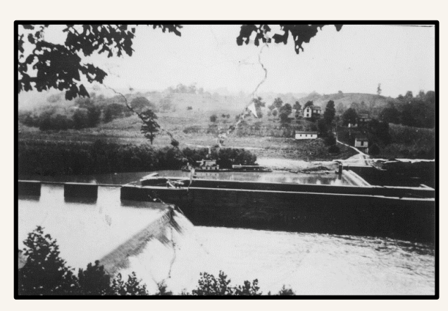
Lock No. 10 reservation during the early twentieth century.