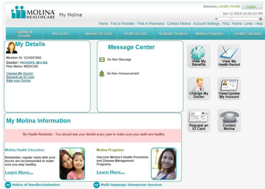
Exhibit C.13-1. Enrollees Can Change PCPs from Our Enrollee Web Portal