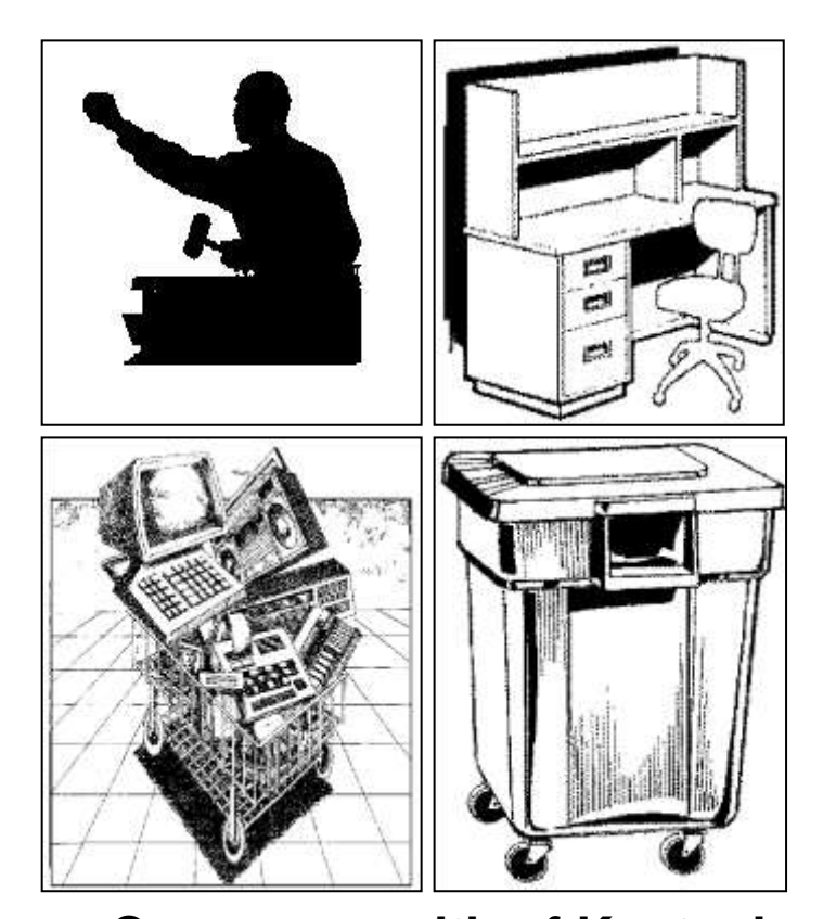
Commonwealth of Kentucky Finance and Administration Cabinet Department for Facilities and Support Services