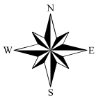
Figure 01: Management Unit Outline Taylorsville Lake W.M.A. Briar Ridge Cedar Harvest