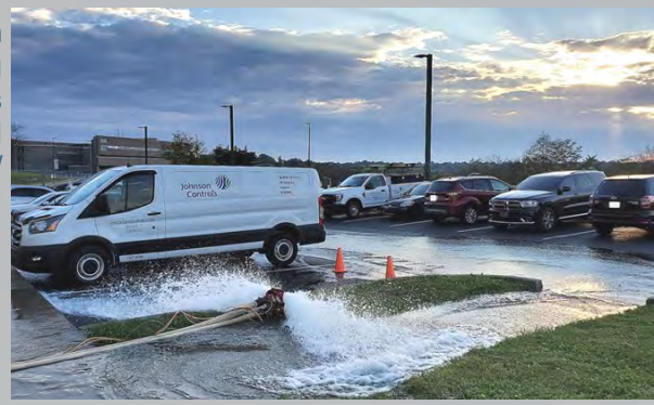
A beautiful day for a fire pump test at Kentucky State University!

If your system is impaired, report your impairment electronically at <a href="https://redetag.fmglobal.com/">https://redetag.fmglobal.com/</a> and for free Red Tag Permit Kits contact <a href="mailto:StateRiskSprinklerProgram@ky.gov">StateRiskSprinklerProgram@ky.gov</a> or your onsite FM Global consultant engineer.