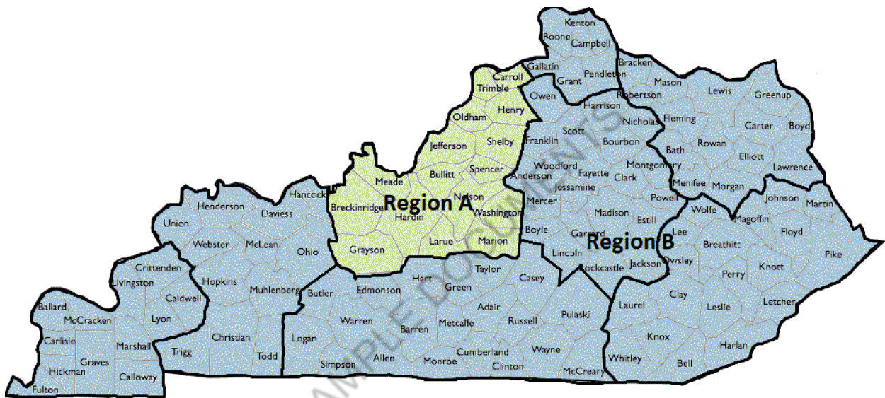
Table 2: Summary of Regions and Counties

The rates were established for two regions to reflect regional differences in claim costs, access, and managed care in the Commonwealth of Kentucky. Table 2 provides a map of Kentucky, its counties, and the regions used for rate setting. The borders within Region B indicate the regions prior to July 2018.